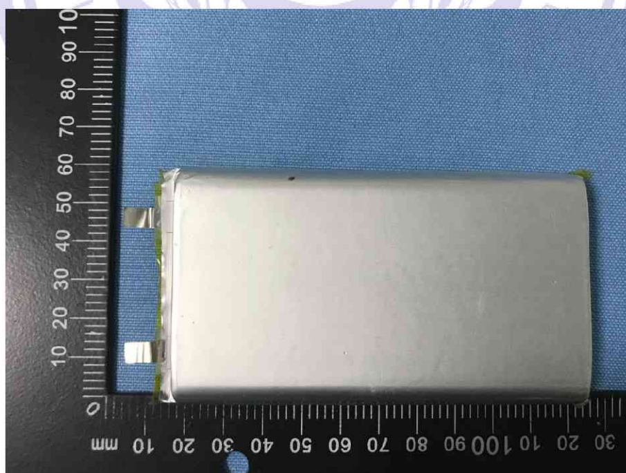
Photo 2 Rear 反面