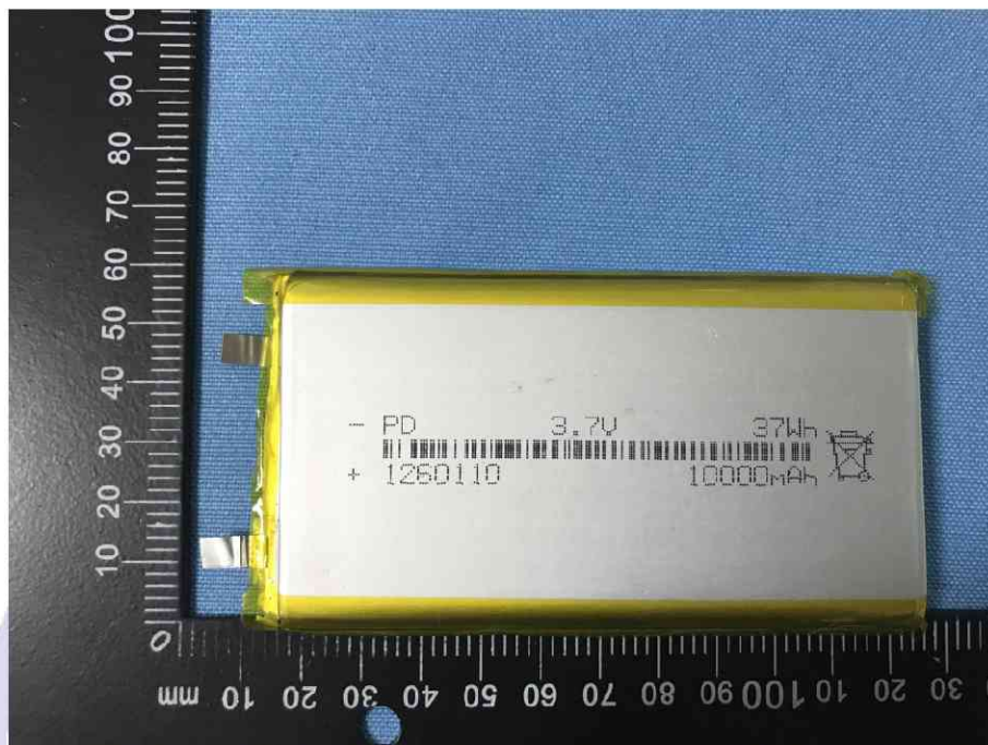
Photo 1 Front 正面